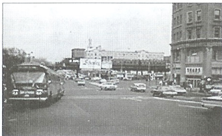
Fordham Road & Webster Avenue

Now that my documentary was finished, I began to look for my next project. After many false starts, I started getting frustrated about what I was going to do next. Then, Christmas 2005 came around and I was shopping the Back in the Bronx catalog. I saw